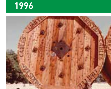
MV XLPE Cables