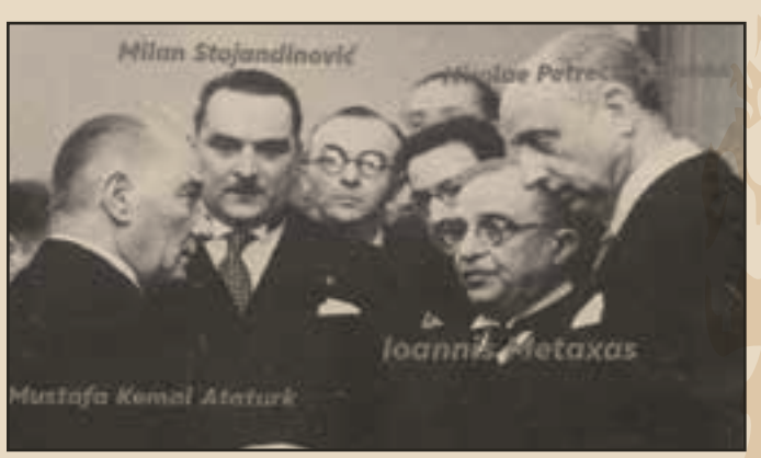
Greece, Turkey, and Yugoslavia sign the Balkan Pact.