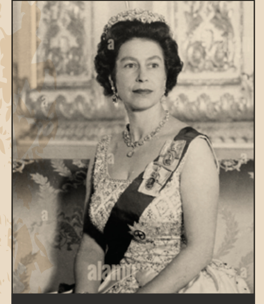
Elizabeth II is crowned Queen of the United Kingdom and the other Commonwealth realms, at Westminster Abbey.