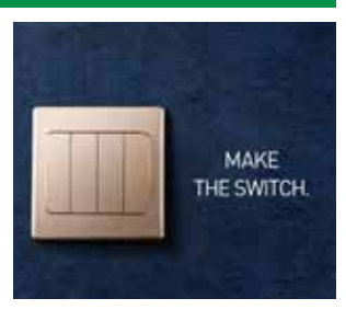
Wiring Accessories Launched