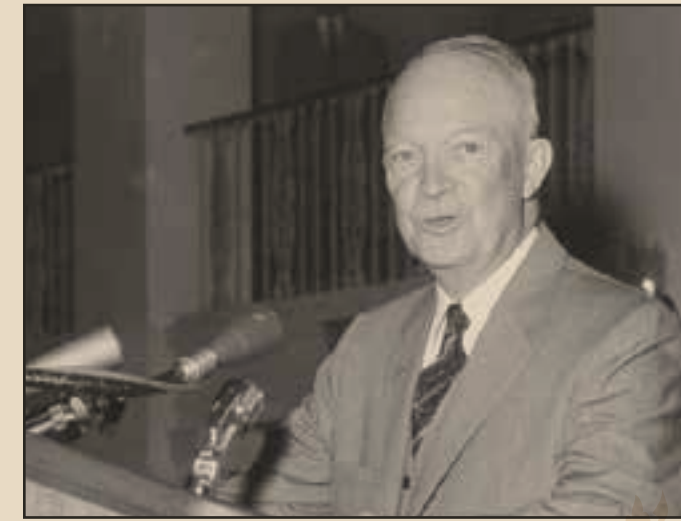
Dwight D. Eisenhower is sworn in as the 34th President of the United States.