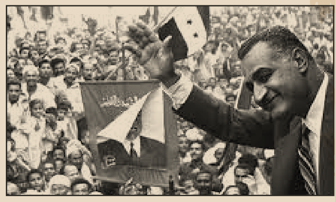
Egypt declares itself a republic.